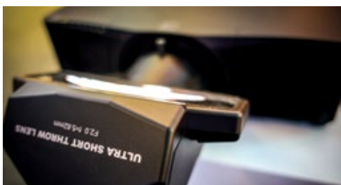
◀ Ultra short throw lens in portrait