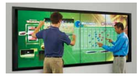
Everything you need for multi-touch interactivity from one source.