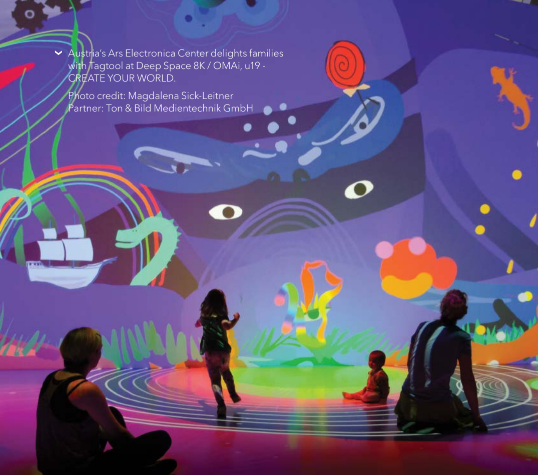
Partner: Ton & Bild Medientechnik GmbH