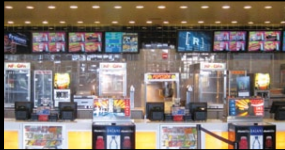
◀ In-lobby digital menu boards at Rave Cinemas.

From the moment they step inside your lobby, patrons expect to be entertained and informed. Christie® solutions can enrich your lobby with mouth-watering digital menu boards and dynamic digital box office displays. Where clear, durable and near-seamless displays are a must, Christie's range of thin and elegant LCD panels will complement any environment with HD content. Showcase feature film trailers with large-format Christie MicroTiles® that can be arranged in a variety of sizes and shapes. With the option to include interactivity, they give you creative freedom to engage your patrons.