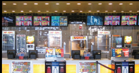
◀ In-lobby digital menu boards at Rave Cinemas.

From the moment they step inside your lobby, patrons expect to be entertained and informed. Christie® solutions can enrich your lobby with mouth-watering digital menu boards and dynamic digital box office displays. Where clear, durable and near-seamless displays are a must, Christie's range of thin and elegant LCD panels will complement any environment with HD content. Showcase feature film trailers with large-format Christie MicroTiles® that can be arranged in a variety of sizes and shapes. With the option to include interactivity, they give you creative freedom to engage your patrons.