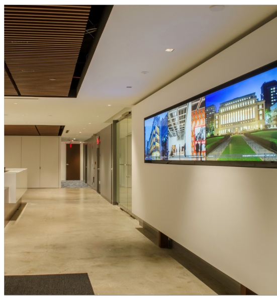
A video wall made of Christie LCD panels showcases JB&B's global projects in the main lobby

Contact us today to find out how your organization can benefit from Christie solutions.