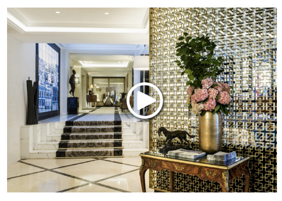
▲ Video: Float4 – Sofitel Hotel (Making-of) (2:56 min)