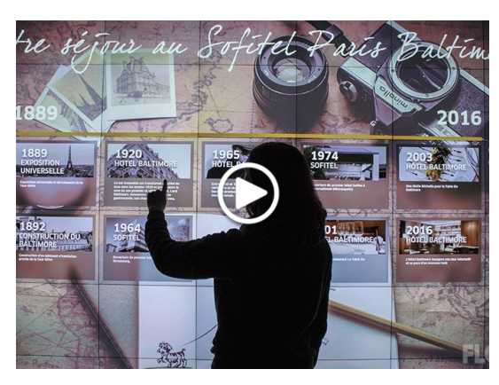
▲ Video: Float4 – Sofitel Hotel – Interactive Wall (1:30 min)

Contact us today to find out how your organization can benefit from Christie solutions.