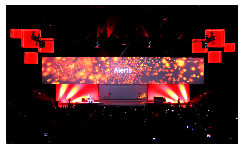
▲ A presenter speaks at an IBM conference in front of a complex visual presentation

Christie Pandoras Box powers eye-popping creative canvas at multi-venue, multi-screen events