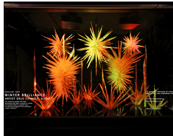
▲ Winter Brilliance window display at Barneys New York flagship store on Madison Avenue.