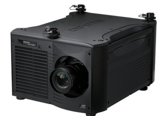
▲ Christie Roadster HD20K-J projector