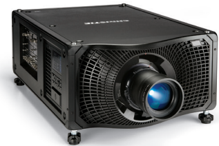
▲ Christie Boxer 4K30 projector

Contact us today to find out how your organization can benefit from Christie solutions.