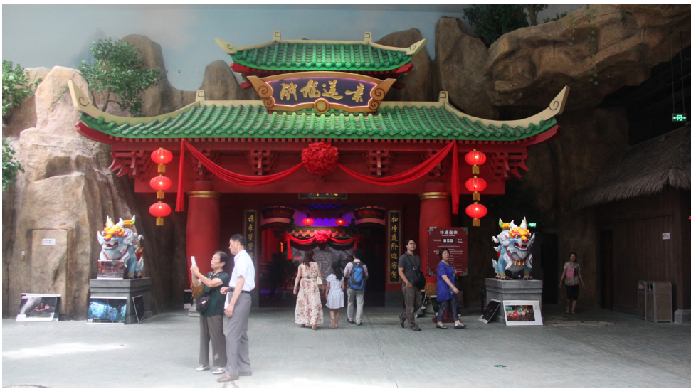
▲ The entrance to the popular ride named after Chinese mythological figure Zhong Kui