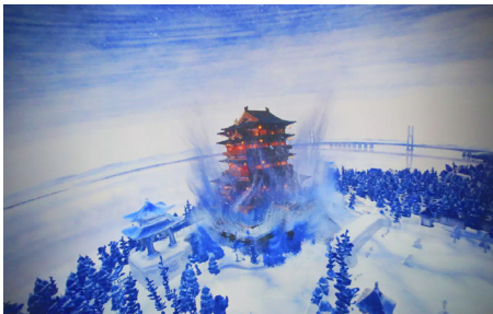
▲ Christie D4K3560 3DLP projectors are used for the highly immersive "Flyover Jiangxi" flight simulation ride