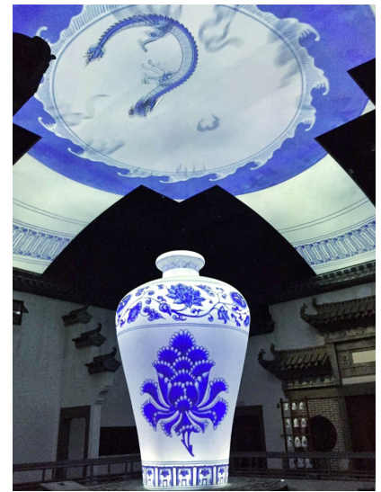
▲ Projection mapping on a huge white porcelain vase using Christie GS Series