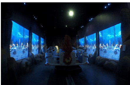
▲ The 3D interactive virtual theater is powered by close to 100 Christie G and Q Series projectors

Anhui Province, is expected to open in September. In addition, five of these mega projects are slated to open within China in the subsequent three years and by 2020, Wanda Group is projected to unveil 15 Wanda City projects in China and five overseas. Needless to say, Wanda Group is among the slew of Chinese conglomerates that are expanding rapidly and actively eyeing a slice of the pie in the international market. As Wanda Group's trusted partner, Christie's technologically