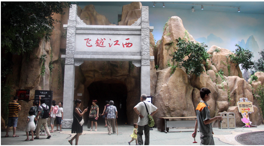
▲ "Flyover Jiangxi" launches guests into a thrilling immersive experience