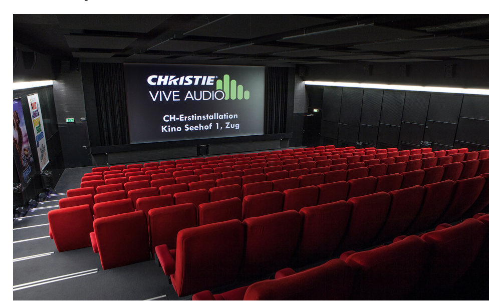
▲ The Kino Seehof in Zug, Switzerland recently underwent an audio system upgrade much to the excitement of audiences and the owner alike.