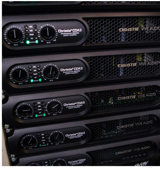
A rack of Christie Vive Audio Class D amplifiers powers the audio system from the projection booth.

Contact us today to find out how your organization can benefit from Christie solutions.