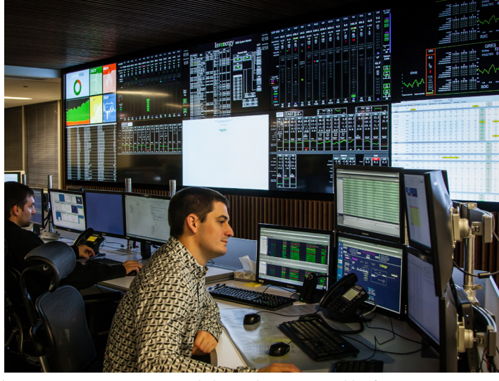
Operators at Invenergy's upgraded control room are capable of monitoring multiple informational streams and respond quickly to any issue.

Contact us today to find out how your organization can benefit from Christie solutions.