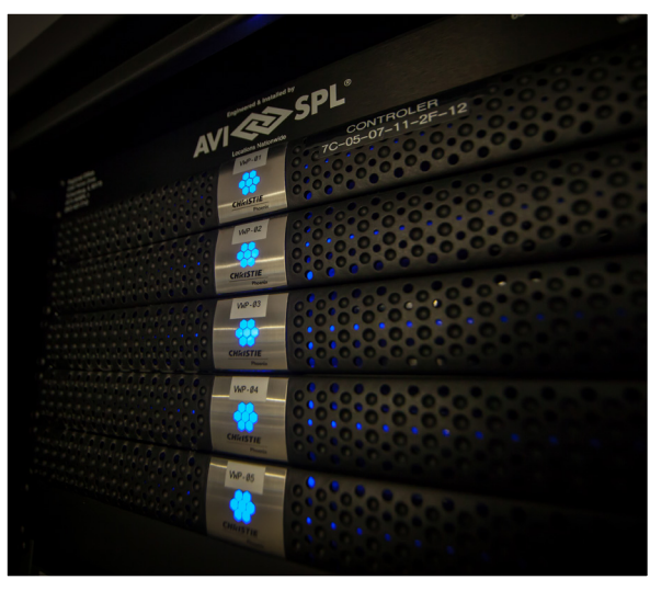
Christie Phoenix provides a scalable platform for the Invenergy Control Center to increase monitoring capabilites as required.