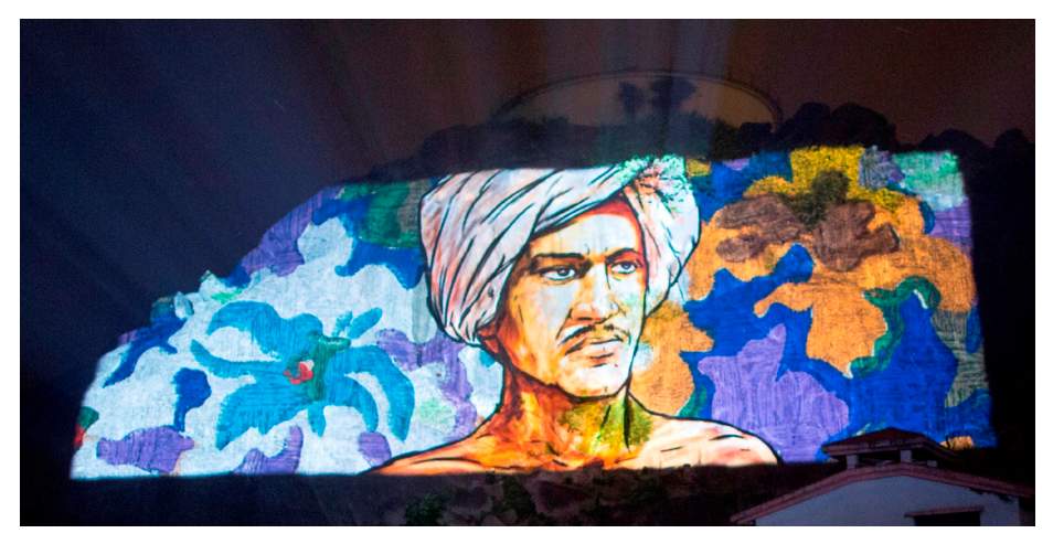
▲ Christie Roadster S+22K-J 3DLP projectors were deployed due to their high brightness and ruggedness.