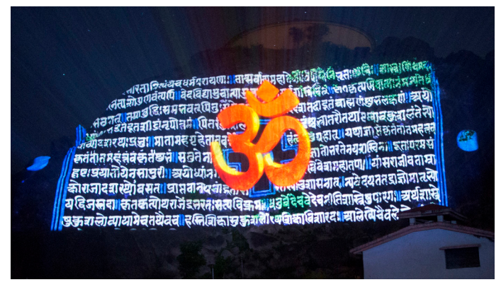
▲ The 40-minute projection mapping show is presented in English and Hindi.

Munda, was visualized by Sabharwal with Indian film celebrities Om Puri and Kabir Bedi providing the voiceovers in Hindi and English respectively. The background score was composed by Indian Ocean, the band famous for producing alternative, earthy music.