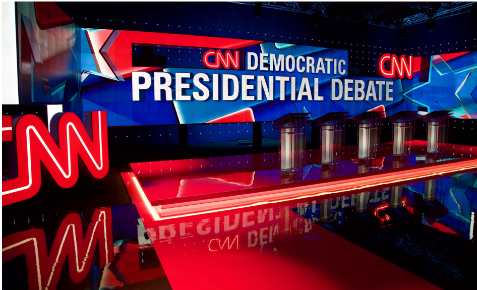
▲ Dynamic stage for CNN's live television broadcast, built using 320 Christie MicroTiles.