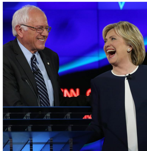
▲ Bernie Sanders and Hillary Clinton shake hands and share a laugh during the debates

Contact us today to find out how your organization can benefit from Christie solutions.