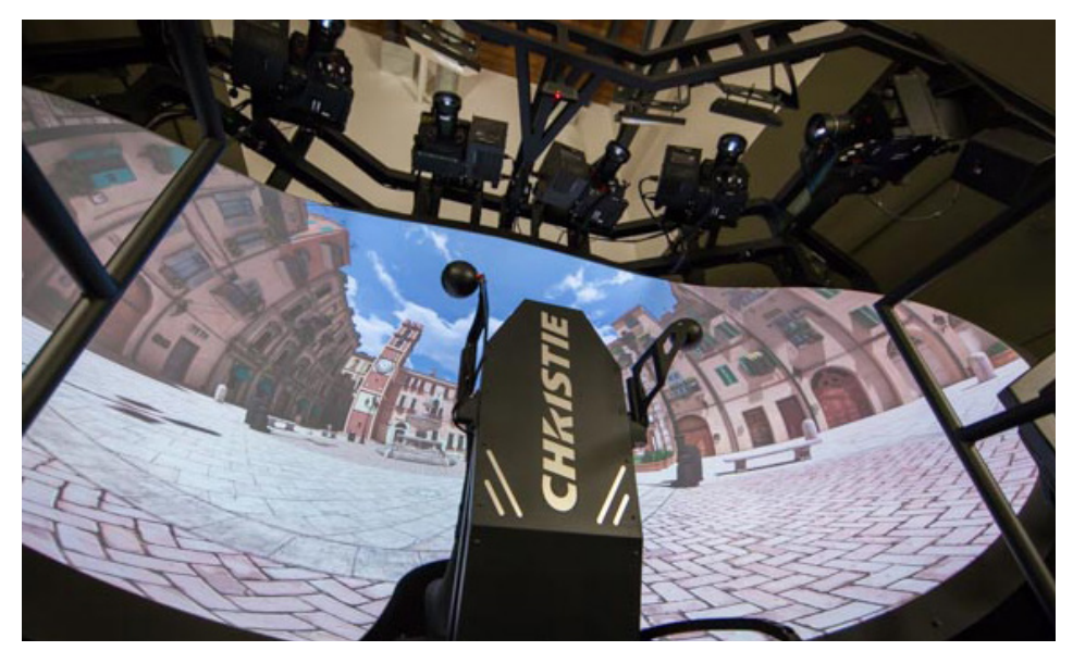
▲ A view into the Christie EGG. This visualization solution enables York U's vision researchers to extend the capabilities of their facility.

If you lose your sense of vision, how do you compensate with other senses? What about reacting to unusual environments such as deep space or deep water? How does your vision give you information that equips you to function within different and constantly changing environments? These are some of the questions that the Centre for Vision Research at Canada's York University seeks to address.