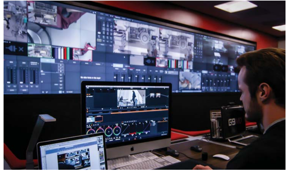
G9MD's command center includes a video wall comprised of 64 Christie MicroTiles. The wall shows videos of surgical procedures, presentations and educational content to be broadcast within a hospital's network, or live-streamed worldwide using G9MD's technology and platform.