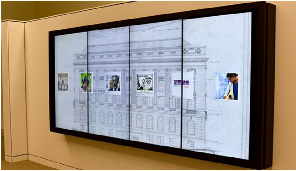
▲ Christie's multi-touch LCD video wall, in the Cleveland Digital Public Library

Capturing the extraordinary stories of ordinary people