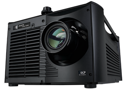
▲ Christie Roadster HD20K-J projector

Contact us today to find out how your organization can benefit from Christie solutions.