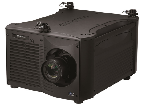
▲ Christie Roadster S+22K-J projector