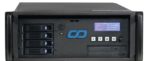
▲ Christie Pandoras Box Media Server