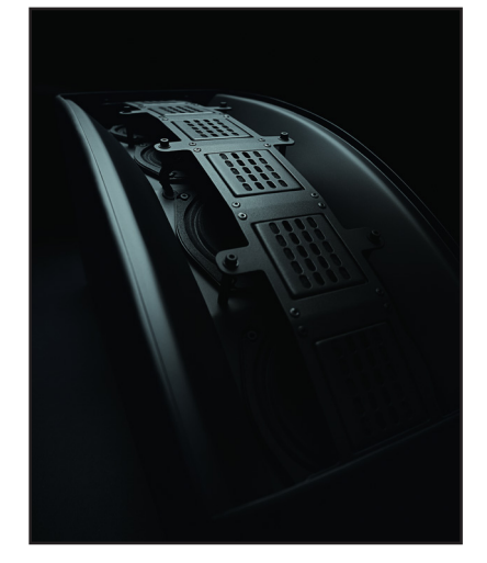
The Christie LA3S surround speaker combines ribbon driver technology with a unique parabolic line array design.

Contact us today to find out how your organization can benefit from Christie solutions.