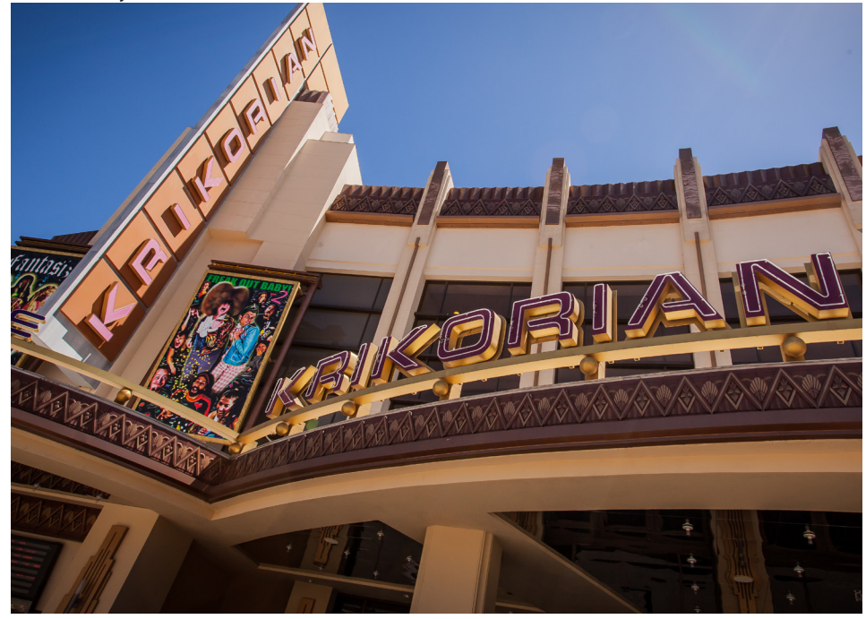
Krikorian Premiere Theatres has installed a Christie Vive Audio system in one of its Buena Park Metroplex 18 auditoriums.