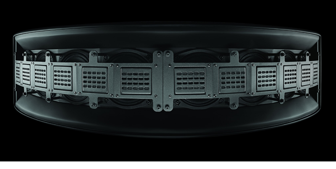
The Christie LA3C is the industry's first ceiling line array surround speaker purpose-built for cinema audio applications.

Comprising a variety of screen channel and surround speakers, subwoofers and Class D amplifiers, as well as an audio/video processor, Christie Vive Audio is a complete solution. At the core of Christie Vive Audio is the combination of Christie ribbon driver technology and line array speaker design. This combination offers superior audio performance compared to traditional point source compression driver-based speakers typically deployed in movie theaters. It represents the ideal platform for immersive cinema audio formats, such as Dolby Atmos.