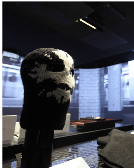
▲ BNY "A New York Holiday" featured a collection of limited edition products designed in collaboration with Shawn "JAY-Z" Carter.

Contact us today to find out how your organization can benefit from Christie solutions.