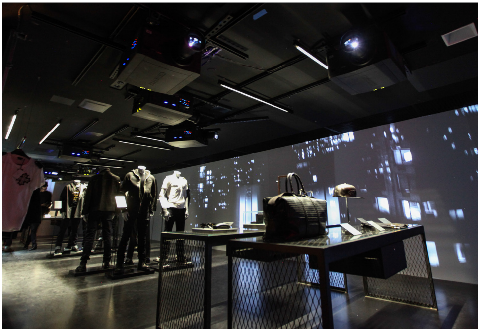
▲ The BNY SCC Gallery is an immersive 1,200-sq ft. featuring seamless 360-degree projection to transport customers into the world of New York.

seemed obvious that we wanted to use light. We wanted to use the technology of light, like video projection, because in that way we could work and do things that are more abstract, more ambitious and revelatory. The only way we could do that was to have absolutely the best technical equipment that exists in the world and our great fortune was to partner with Christie, not only for the technology, but for the support."