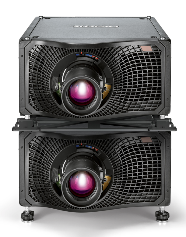
Christie Mirage SST 6P projection system

Christie's newest RGB laser projector is designed for brighter, better 3D attractions. The Mirage SST-6P began rolling out in March 2021 as part of Christie's expanding line of RGB laser projectors. It is engineered to serve the 3D attractions market - allowing operators to benefit from new advances in laser projection and 3D technology, higher frame rate, resolution and color saturation - while leaving behind the issues and drawbacks of older systems.