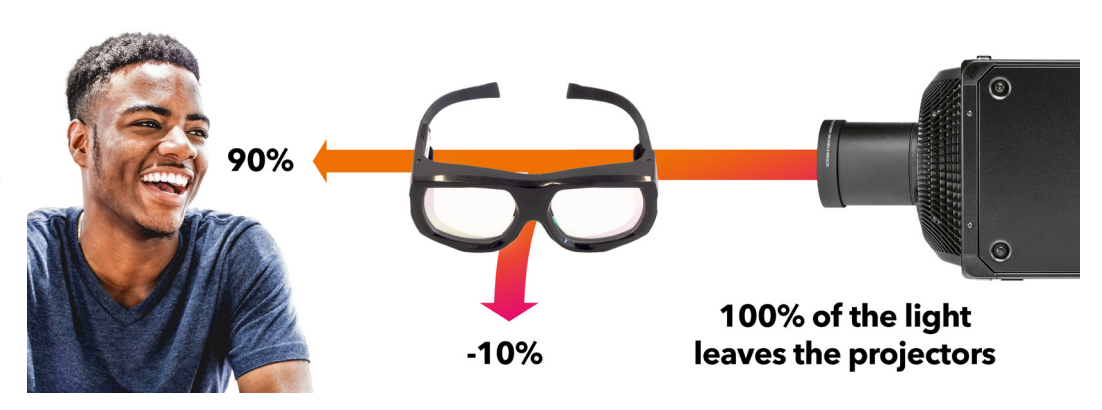
With no need for filters in the projectors, 6P 3D RGB laser projection systems output all their energy on screen and just 10% of the light is absorbed by the glasses. The result is 90% efficiency with all of this light reaching audience eyes.